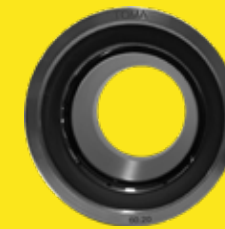
Diamond Coatings up to 180mm