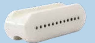
Special and customised products

We produce all types of capstans, pulleys and rings with Ceramic Coating (TBC), Metal Coating (TMC), Synthetic Zirconium Oxide Ceramic and Natural Zirconium Oxide Ceramic.