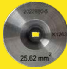
Cross-Section in TC