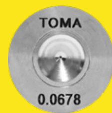
Superfine in Natural Diamond