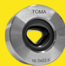
Cross-Section with Diamond Coating