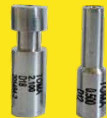
Enameling dies in PCD or TC