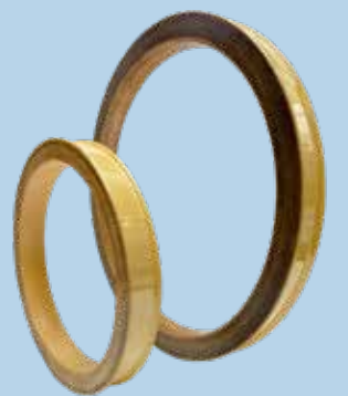
Reconditioning of capstans, pulleys and rings