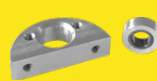
Special and customised products