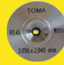
Cross-Section in PCD