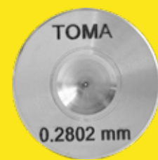
Synthetic Monocrystalline Diamond